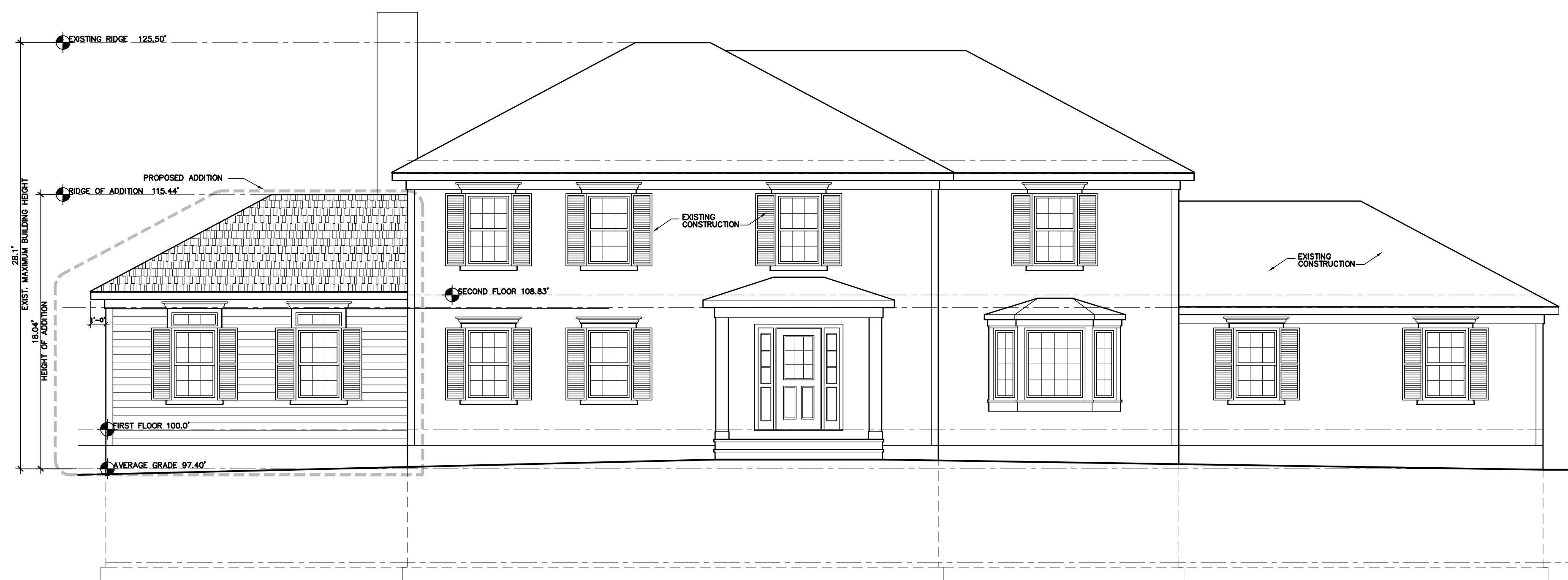
1 FRONT ELEVATION 3/16" = 1'-0"