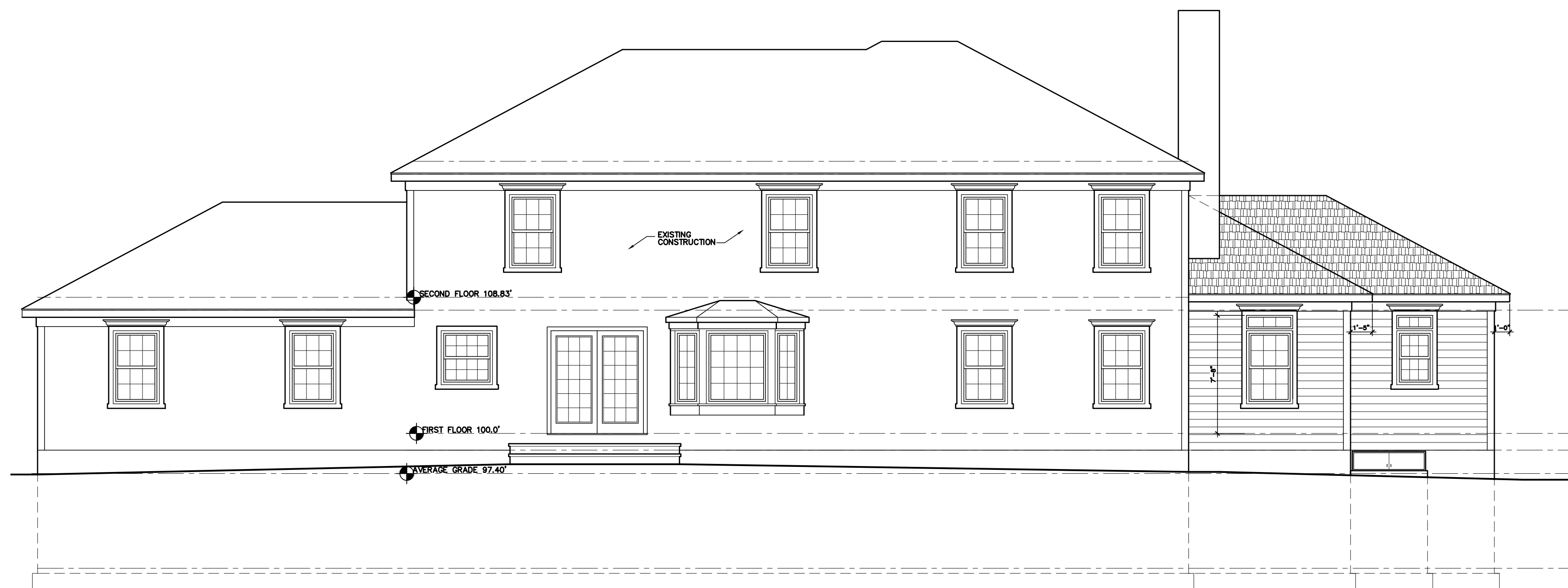
2 REAR ELEVATION 3/16" = 1'-0"