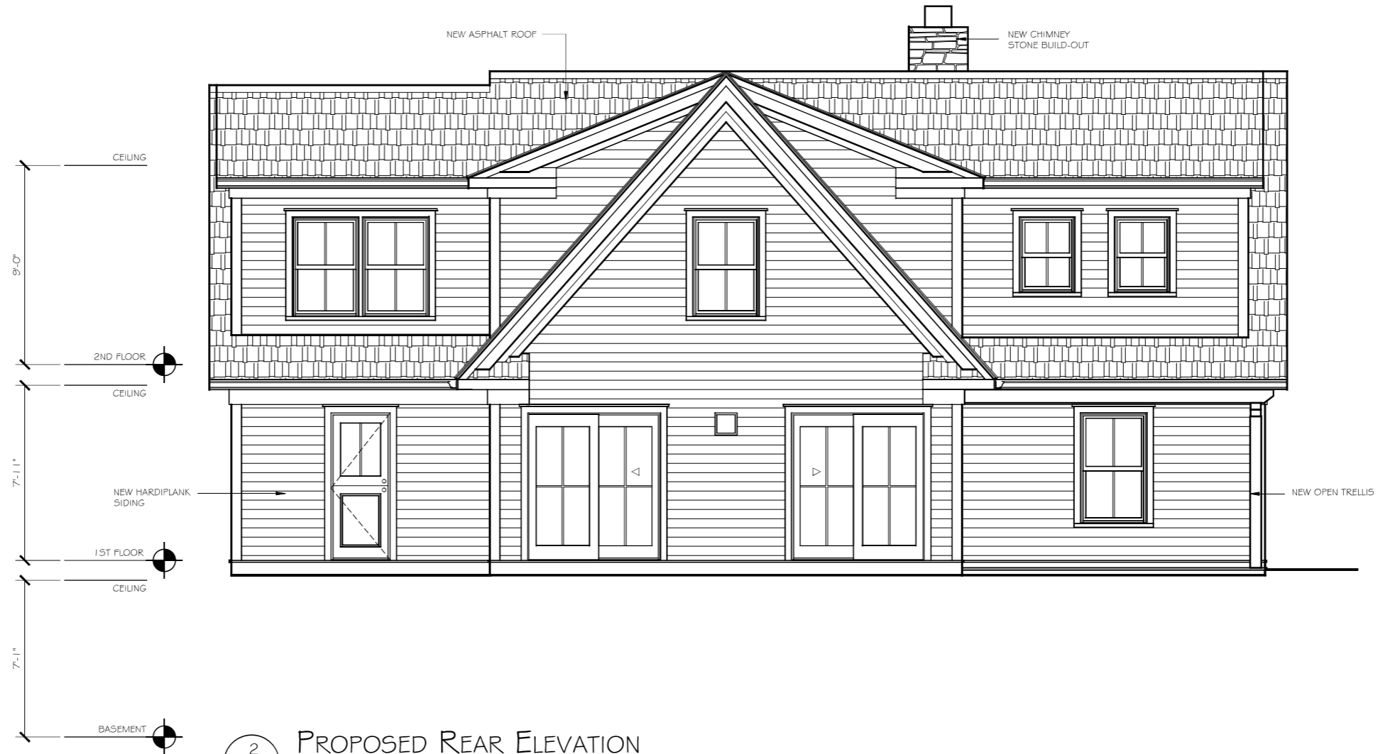
2 A6 PROPOSED REAR ELEVATION SCALE: 1/4" = 1'-0"