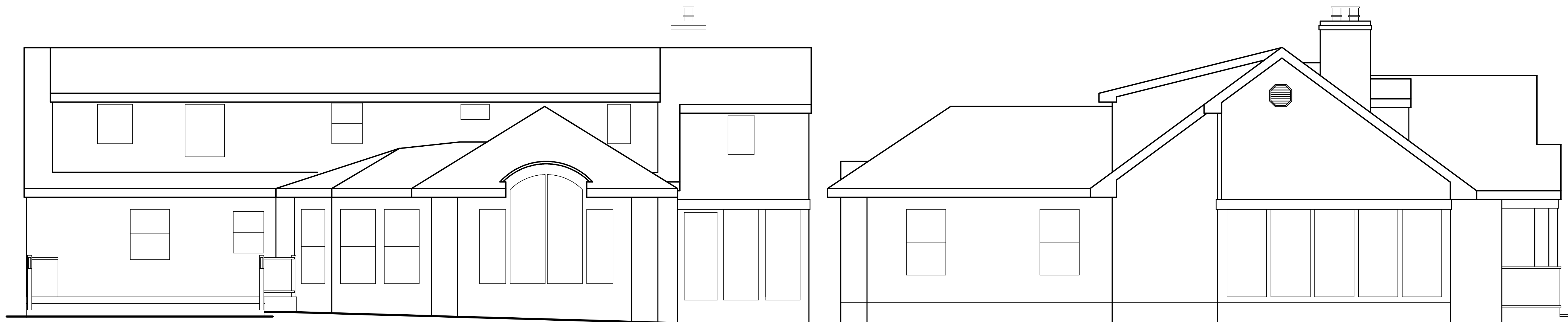
EXISTING REAR ELEVATION SCALE: 1/4" = 1'-0"