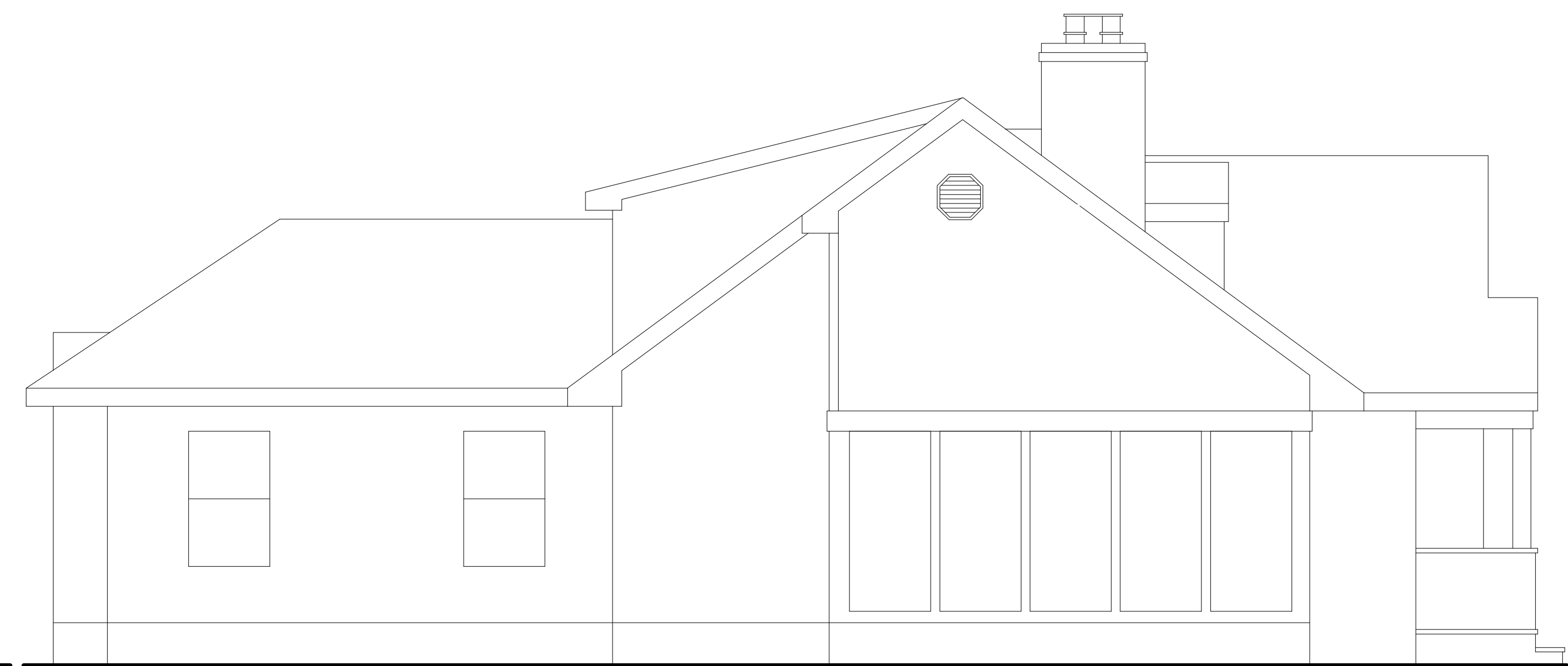
EXISTING (NO CHANGE) LEFT ELEVATION SCALE: 1/4" = 1'-0"