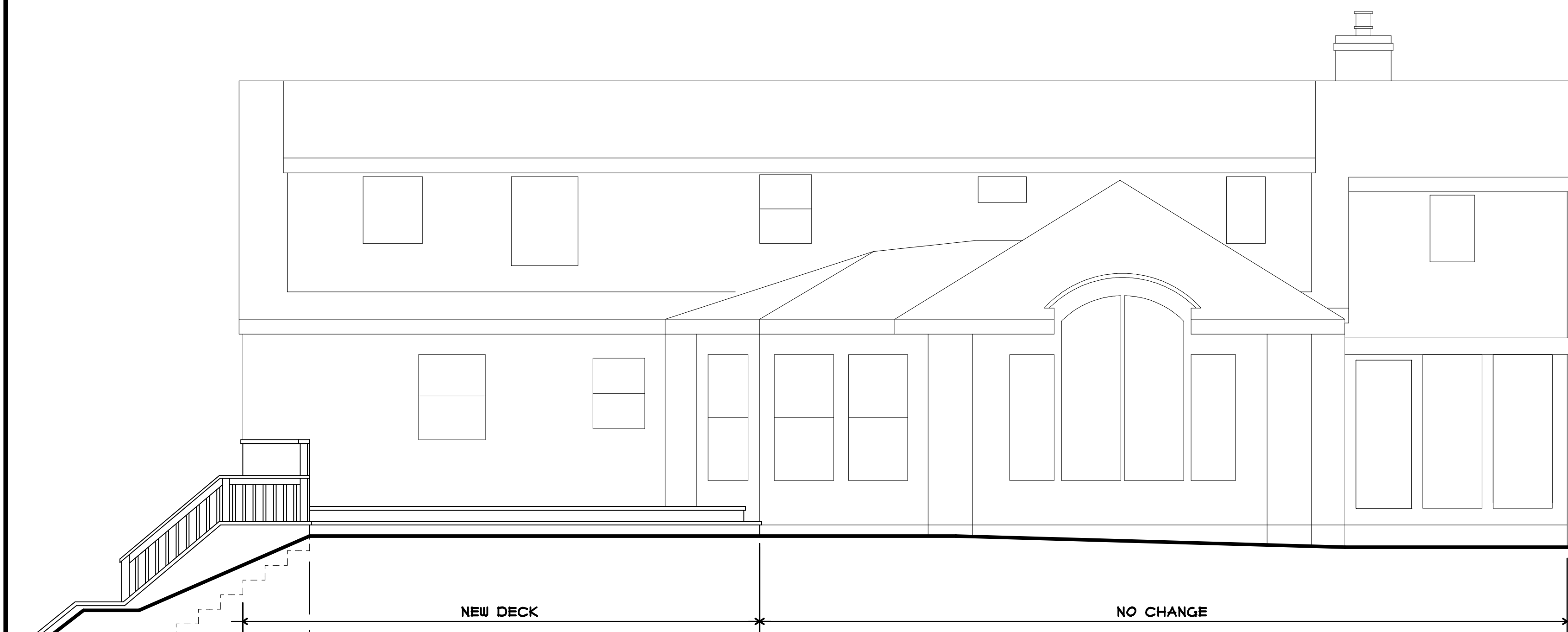
PROPOSED REAR ELEVATION SCALE: 1/4" = 1'-0"