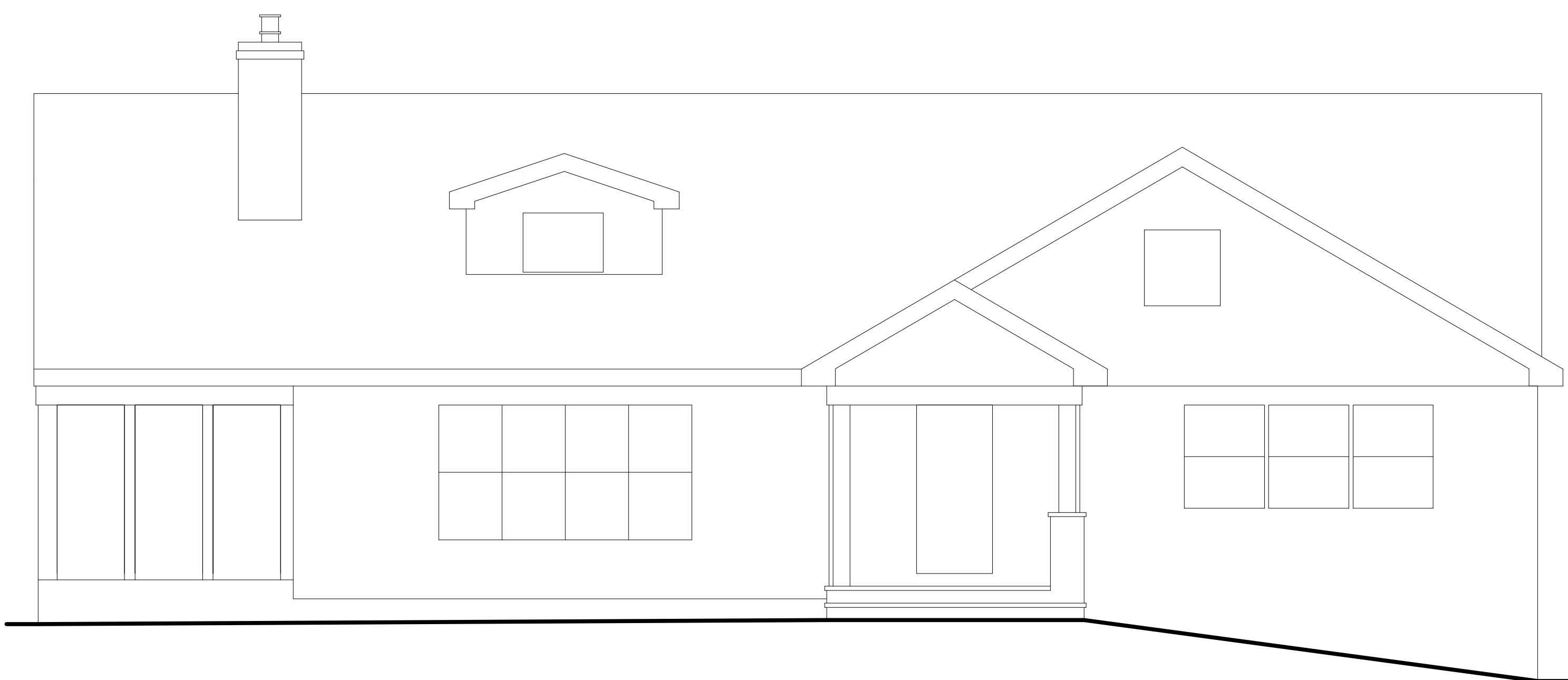
EXISTING (NO CHANGE) FRONT ELEVATION SCALE: 1/4" = 1'-0"