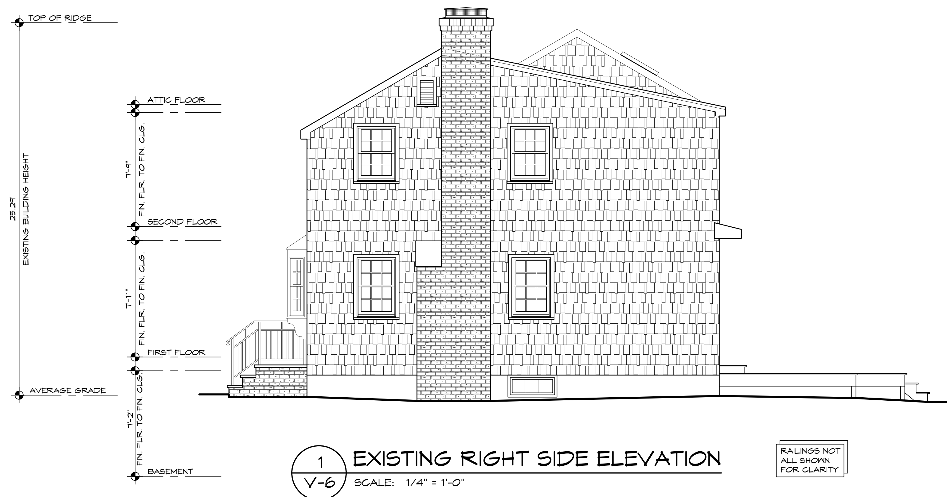
1 EXISTING RIGHT SIDE ELEVATION V-6 SCALE: 1/4" = 1'-0"