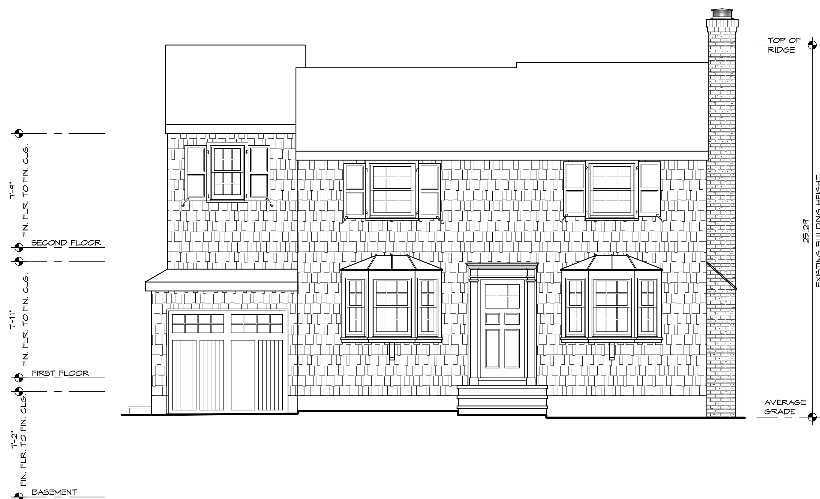
1 EXISTING FRONT ELEVATION V-5 SCALE: 1/4" = 1'-0"