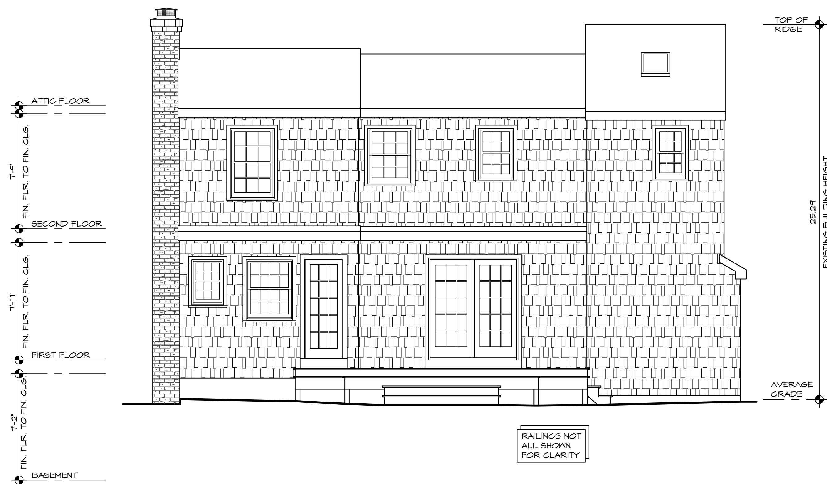
3 EXISTING REAR ELEVATION V-5 SCALE: 1/4" = 1'-0"