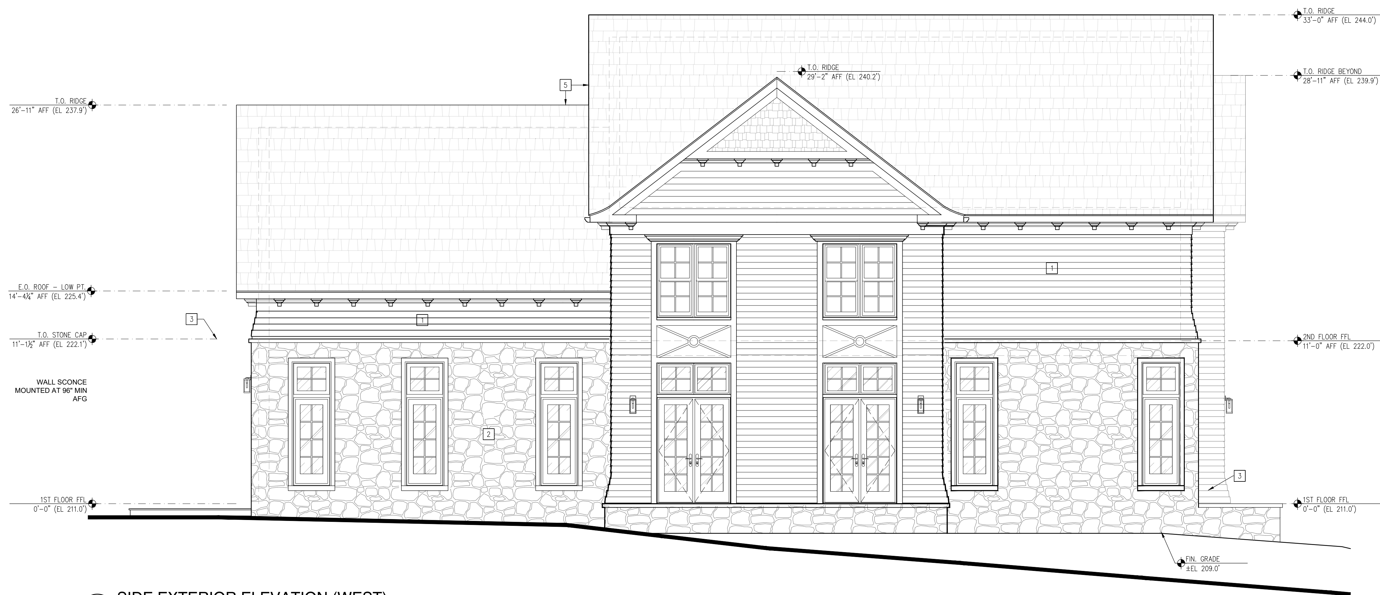
2 SIDE EXTERIOR ELEVATION (WEST) SCALE: 1/4"=1'-0"