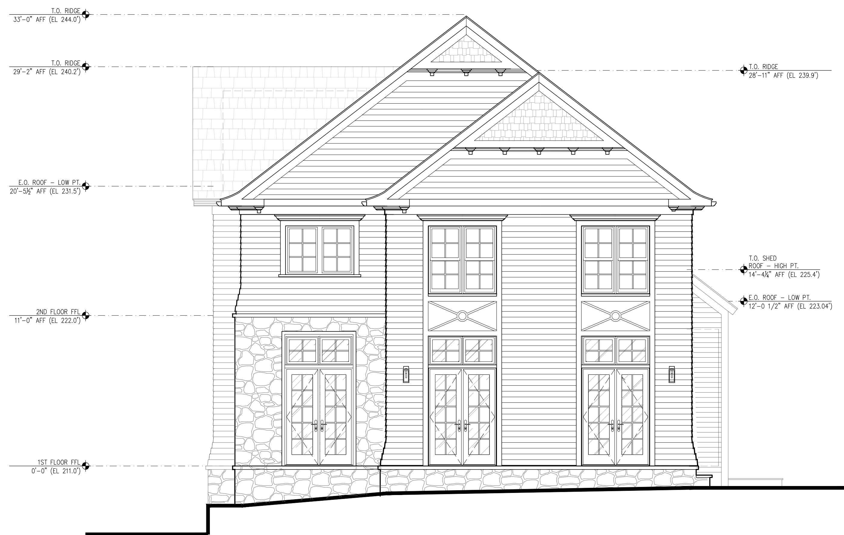
1 FRONT EXTERIOR ELEVATION (NORTH @ MADISON AVENUE) SCALE: 1/4"=1'-0"