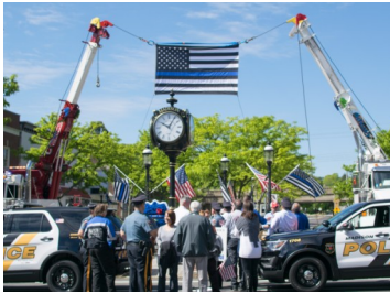
The Police Unity Tour makes it way through Florham Park and Madison on their way to Washington D.C. Thanks to Madison and Florham Park Fire Department in helping with the flag sendoff!