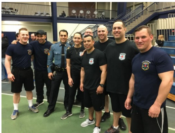
Madison Police PBA, the Downtown Development Commission, and Drew University sponsored a great dodge ball fundraiser today at the Drew Forum! PBA Team "Donuts and Dodge" took 4th place!

*Special Council Meeting* - Putting Actions Behind Our Words: Monday, April 3rd from 7:00 to 9:00 PM in the Council Chambers on the second floor of the Hartley Dodge Memorial (Borough Hall) at 50 Kings Rd.