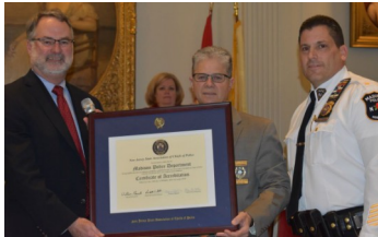
The Madison Police Department was recognized at Monday's Borough Council meeting for receiving accreditation from the New Jersey State Association of Chiefs of Police. Click for full article.