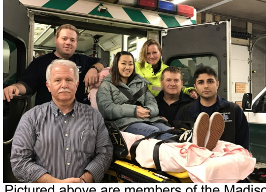
Pictured above are members of the Madison Volunteer Ambulance Corps testing new electric stretchers and electric power lifting equipment. Click for the full article.