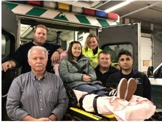
Pictured above are members of the Madison Volunteer Ambulance Corps testing new electric stretchers and electric power lifting equipment. Click for the full article.