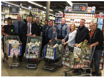
The Madison Policeman's Benevolent Association Local 92 is sponsoring a food drive. During that period residents may drop off non-perishable food donations. Click for full article.