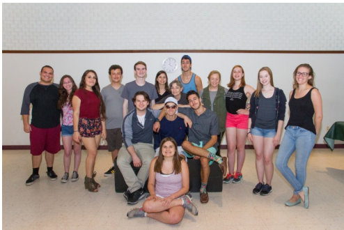
4 A.M. Musical Cast